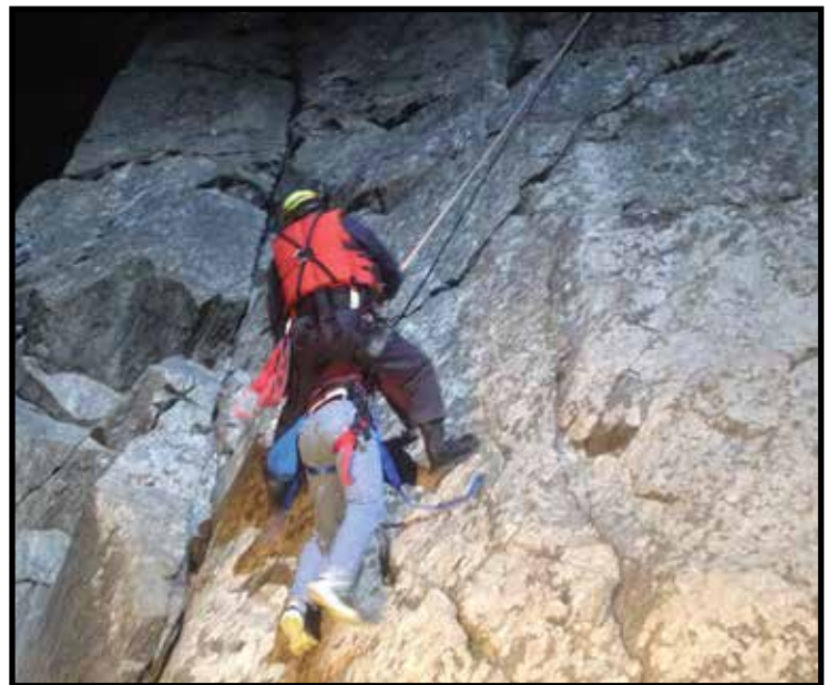
Rope Rescue . . . a firefighter rappels down to rescue a stranded hiker on a rock ledge in Great Falls Park on December 28, 2014.

EMS ..... 66,550 Total Incidents ..... 91,308 Fire ..... 18,256 Patients Public Service ..... 6,502 Transported ..... 48,966