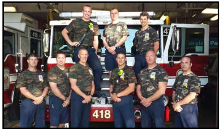
Community Involvement . . . firefighters honored all those veterans that made the supreme sacrifice by wearing camouflage t-shirts during Memorial Day weekend.