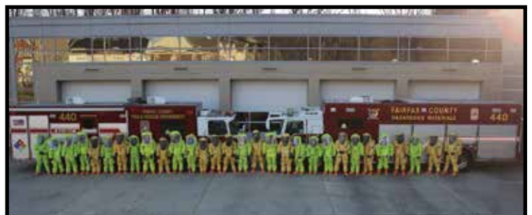
A first . . . the first all Advanced Life Support (ALS)/Hazardous Materials Technician School graduated January 17, 2014, at Fire and Rescue Station 40, Fairfax Center.