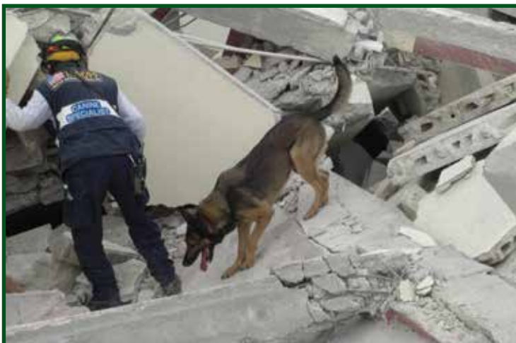
A Virginia Task Force 1 K-9 team conducts training on a rubble pile during a regular training exercise.