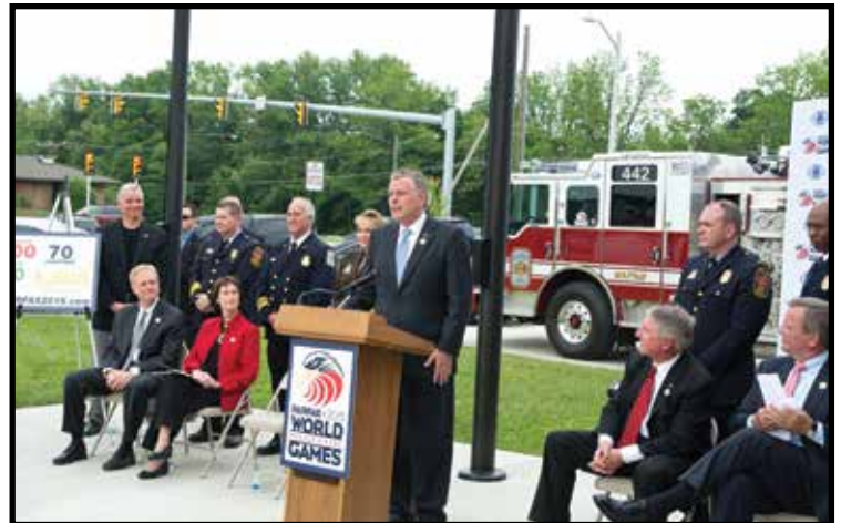
World Police and Fire Games Kick-Off . . . Virginia Governor Terry McAuliffe participated in the kick-off of the Fairfax 2015 World Police and Fire Games at Fire and Rescue Station 42, Wolftrap, and was named Honorary Chairman of the Games.

Virginia Task Force-1 (VATF-1) - a premier disaster response resource governed through federal partnerships with United States Agency for International Development, (USAID), Department of Homeland Security, (DHS), and the Federal Emergency Management Agency, (FEMA). Deploys nationally and internationally to natural and man-made disasters on short notice. Teams have deployed to Armenia, Kenya, Turkey, Taiwan, Iran, Haiti, Oklahoma City, The Pentagon, Japan, and numerous other disaster locations within the US and abroad. Costs and expenses for training, equipment, supplies, and personnel are paid by the federal government.