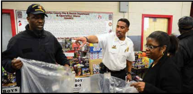
Community outreach . . . Firefighters, civilians, and retired members come together to distribute several thousand toys for children December 17, 2013.

General fire safety presentations including home escape planning, proper smoke alarm placement, and fall and injury prevention.