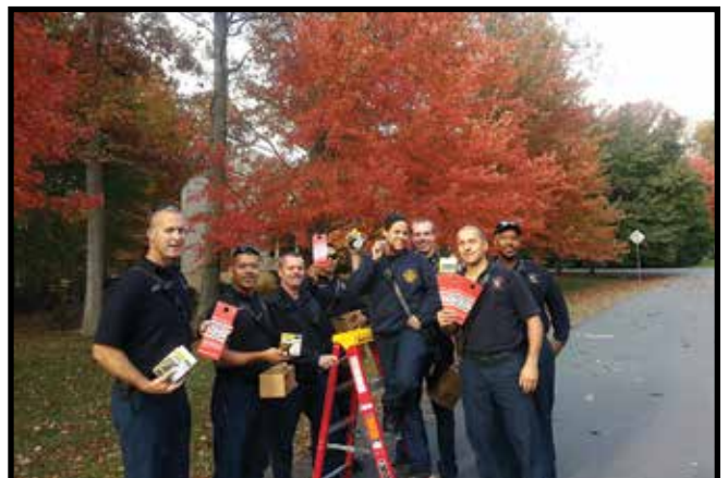
Safety In Our Community (SIOC) . . . Crews from Fire and Rescue Station 39, North Point, conduct SIOC operations as the department winds down the 2013 fall SIOC program.

* Volunteer Department affiliated with these stations.