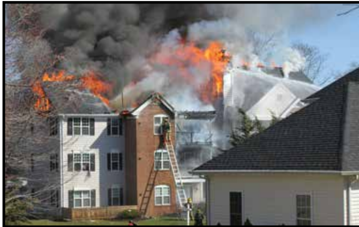
Firefighters from Fairfax County and Fairfax City fight a large garden apartment fire in Fairfax City on March 3, 2014.